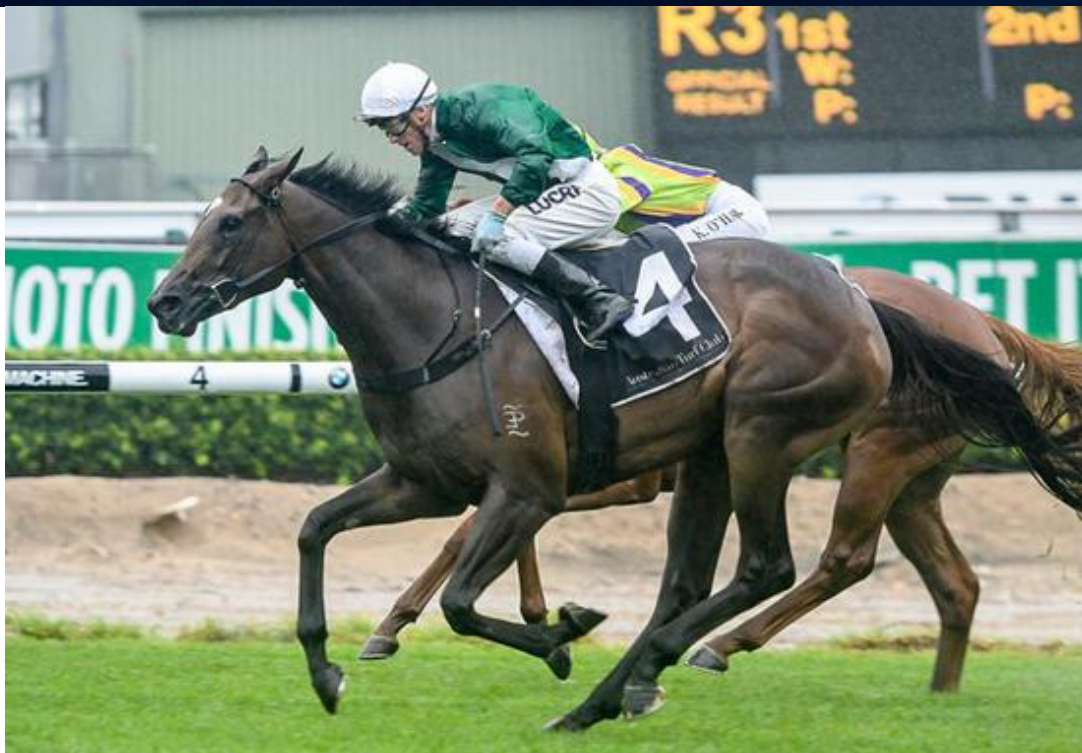
Group 2 Winner – One More Honey

Best of luck to all connections involved!